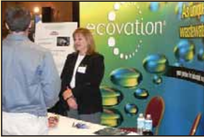
Ecovation was one of more than 35 companies to exhibit at the Alternative Energy in New York: Expo 2006 .